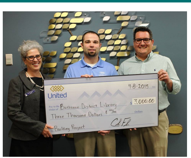
A big thank you to United Federal Credit Union for their generous donation to the Building Fund!